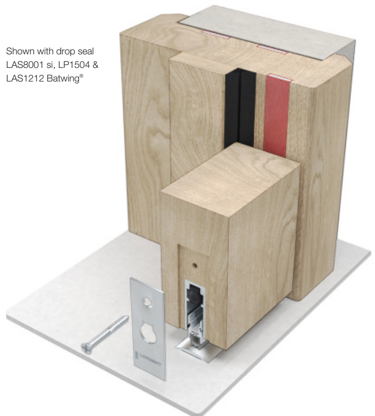
Shown with drop seal LAS8001 si, LP1504 & LAS1212 Batwing®

(Note : Clear does not restrict light penetration).